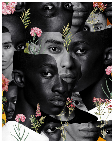
ARTWORK FROM LEFT: Alexis Tsegba, "Come As You Are," 2019; "Interconnected," 2019

Organizations are not race neutral. Scholars, managers, journalists, and many others routinely recognize "black capitalism," "black banks," and "ethnic restaurants," yet we think of banks that are run by and serve whites simply as "banks" and white corporations simply as